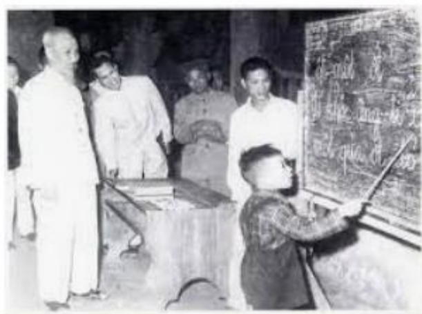
Fig.1- President Ho Chi Minh