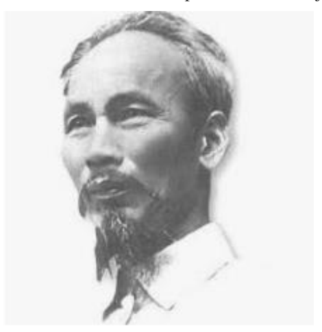
Fig.2 – President Ho Chi Minh