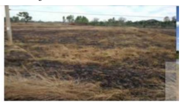
Fig.2 - Thailand soil for agriculture

Organic agriculture can provide better income than conventional agriculture if farmers have organic certificated which is required in the specific market as the products quality guarantee and to be sold at a reasonable price. Hence, we need to train farmers to have correct knowledge and understanding in using organic fertilizers according to the kinds of plants including green manures that are suitable for growing rice and field crops such as sugar cane, tapioca, while the compost is suitable for fruit trees and vegetables.