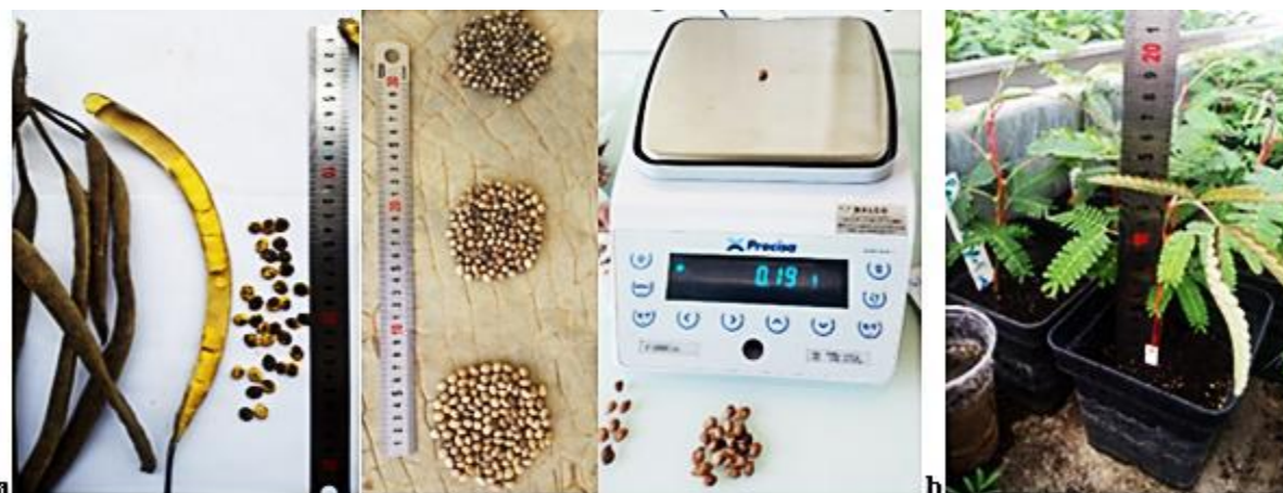
Fig. 1 Images of hulling, sorting of healthy seeds and measurement of the dimensions of each seed (a) and then of three-month-old seedlings in the greenhouse.