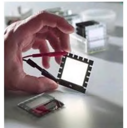
Fig.2: White OLED device for lighting applications.

A simplified OLED structure (Figure 1) is composed of an electron injecting cathode, organic transport and emitting layers, and a hole injecting contact. The ITO typically is in direct contact with air. The organic layers include a doped emissive layer but may also incorporate a hole transport layer and an electron transport layer. These devices have adapted from a single heterostructure to a double heterostructure which increased the theoretical IQE and EQE of 25% and 5%, respectively<sup>10</sup>. This relatively low limit is because the dopants utilized were fluorescent/singlet-type; meaning only singlet excitons resulted in radiative recombination. Since singlet-type excitons account for only a quarter of all excitons, only 25% of the total exciton recombinations within these materials resulted in optical emission. To overcome this limitation, triplet/phosphorescent-type materials were newly synthesized and added to OLEDs11.